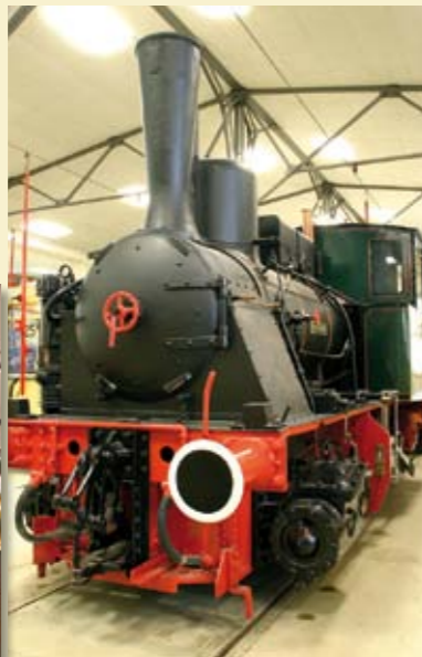
Heritage vehicles illustrating the history of public mass transit in Frankfurt and environs